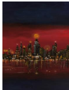
Holly Schuh Acrylic and Mixed Media