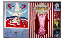
Exhibit runs from October 4- October 29