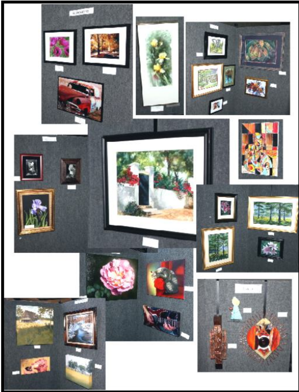
MEMBERSHIP SHOW 2011 RANDOM SELECTION