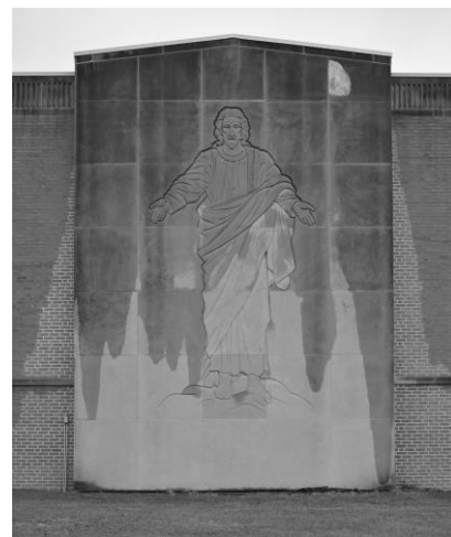
"Stones Cry Out"