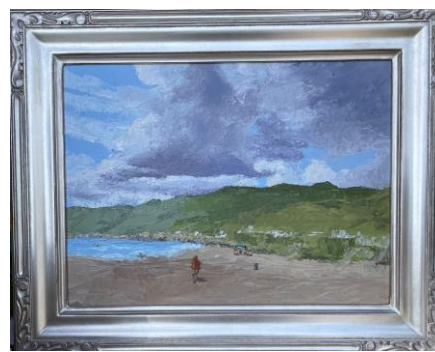
Rain is a comin'