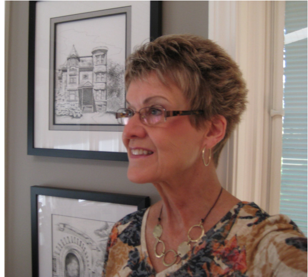
WATER COLOR/PEN & INK